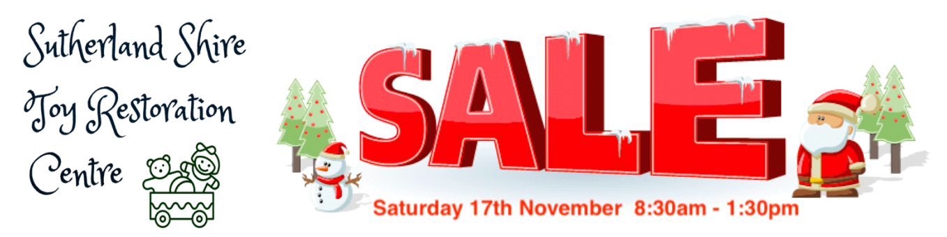
Cnr Jannali Avenue & Mary Street, Jannali

With Christmas approaching fast, you can help support this wonderful organisation by heading to their annual Christmas sale, on Saturday 17th November 2018 , between 8:30am and 1:30pm . There is a huge range of toys available at very reasonable prices, including cars, dolls, games and bikes for all ages. Why not head over and grab some Christmas bargains, while helping out some very worthy charities?