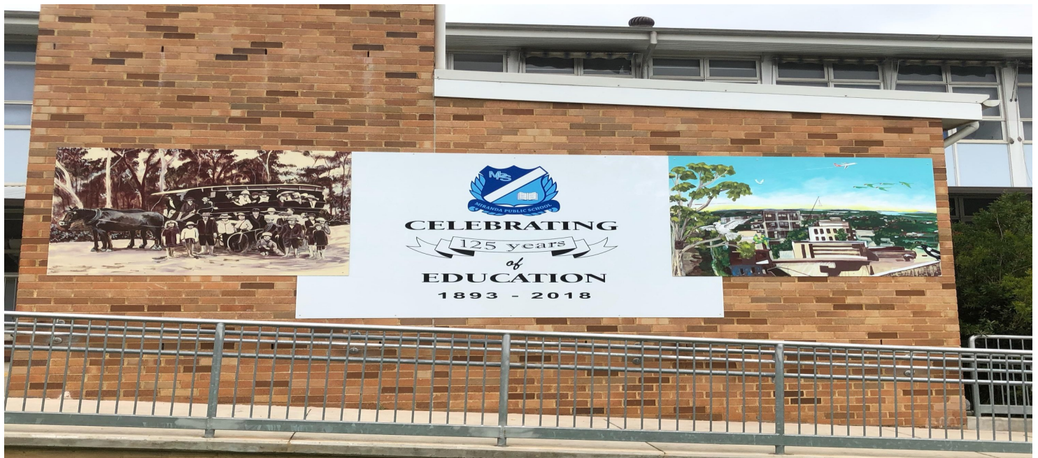
Our wonderful Mural