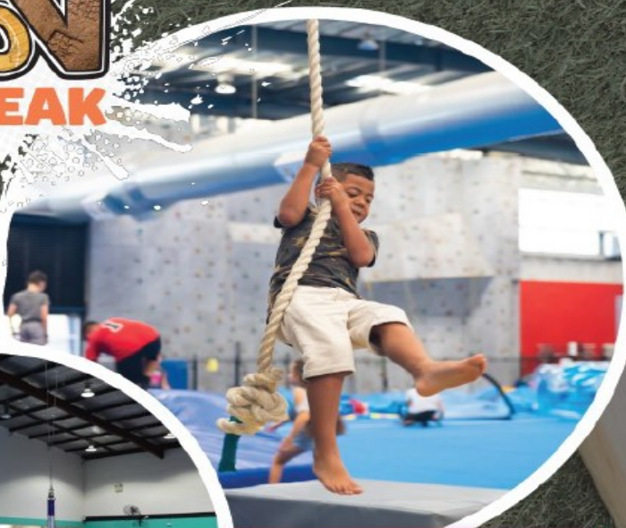
Gymnastics and more!