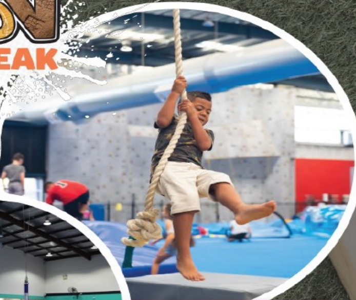
Gymnastics and more!