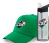
MASTER BLASTERS KIT