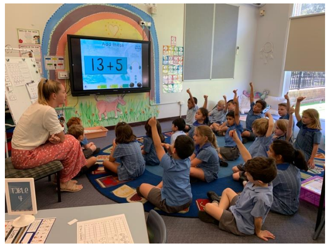
K/1J were involved in a very interesting number talk about all of the different strategies they could use to successfully solve 13 + 5 .